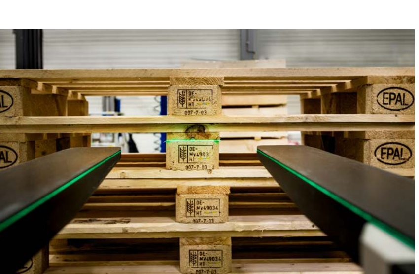
height the fork arms need to move into the pallet's forklift pockets.