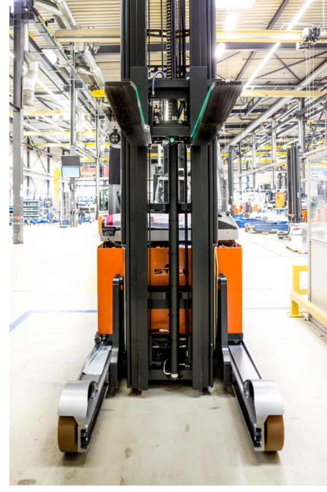
Line laser from LAP on the STILL FM-X 20 HD reach truck. Lifts loads of up to 2000 kilograms to heights of 13 meters at speeds of up to 0.50 m/s.