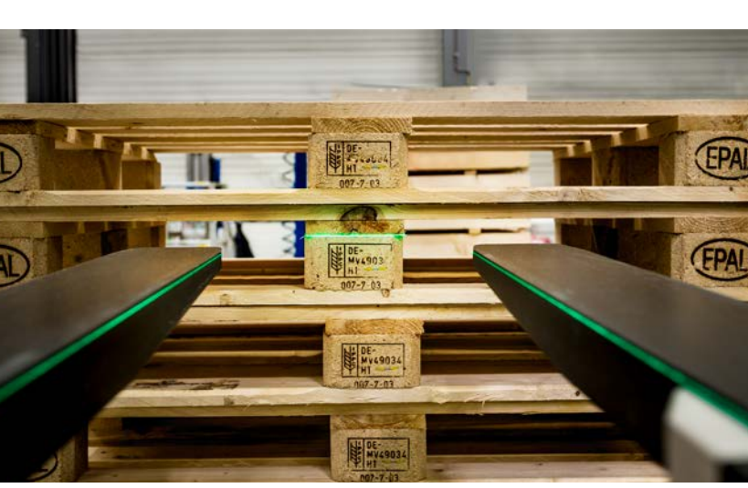
The clearly visible laser line precisely shows drivers at which