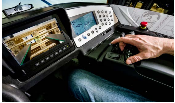
Full view of the situation: Drivers can see on a monitor when the exact target position has been reached.