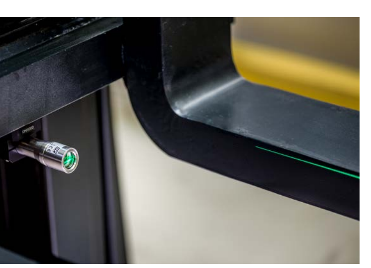
The XtrAlign HY positioning laser with a green laser diode is mounted between the fork arms on the fork carriage.