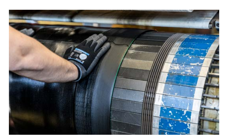
Changes by the minute: The precise positioning of each tire layer on the tire-building drum is checked using the laser lines. The green diodes of the latest SERVOLASER generation SLX provide even better visibility.

To take advantage of further benefits, Pirelli decided to integrate the SERVOLASER Xpert, thereby raising its machine equipment to the next technological level. Over 30 years of experience in the development and manufacture of laser projection systems have gone into the SERVOLASER Xpert. Thanks to continuous development, LAP now sets the world standard for quality assurance in tire production with the SLX. Its projection accuracy of \pm\,0.18 mm at a one-meter projection range is currently unmatched. SERVOLASER Xpert is fitted with green diode technology. Laser sources with green diodes have a service life equal to that of red diodes, but provide higher visibility to the human eye on black surfaces. This further minimizes errors, which improves process reliability in tire building. Pirelli has enjoyed a positive experience with LAP's laser systems, and the company plans to continue using them. As machines are upgraded, they will be equipped with LAP's third-generation positioning lasers.