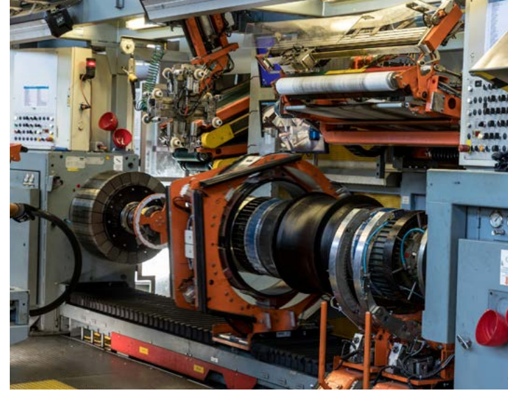
Flexible manufacture: Pirelli produces a wide variety of tires in the same shift on the same tire-building machine.