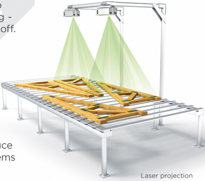
Laser projection system by LAP